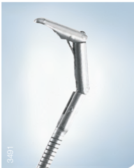
Guiding device with bendable tip for easier access to target airways

The bending and rotating mechanism enables the guiding device to access airways at difficult bifurcations.