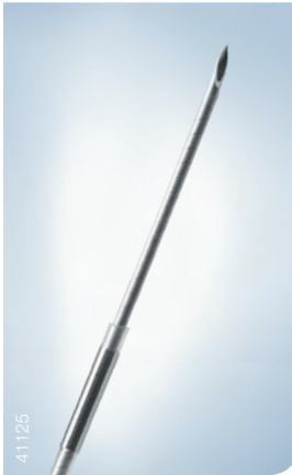
PeriView FLEX dedicated peripheral TBNA needle

Olympus has released a 21G needle dedicated to the periphery, compatible with either the BF-MP190F or the GuideSheath. The needle is expected to help to increase the diagnostic yield in the periphery as well as to improve access to target sites thanks to enhanced needle flexibility.