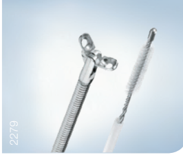
Brush and forceps compatible with 2.0 mm GuideSheath or with the BF-MP190F

Dedicated brush and forceps for 1.7 mm working channel or GuideSheathKit 2