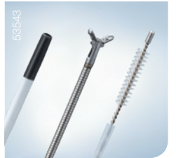
GuideSheathKit 2 compatible with 2.0 mm working channel

Combined with a 2.0 mm or 2.8 mm working channel bronchoscope, the GuideSheathKit 2 acts like an extended working channel, allowing safe and repeated access to the lesion with the dedicated needle, brush, and forceps.